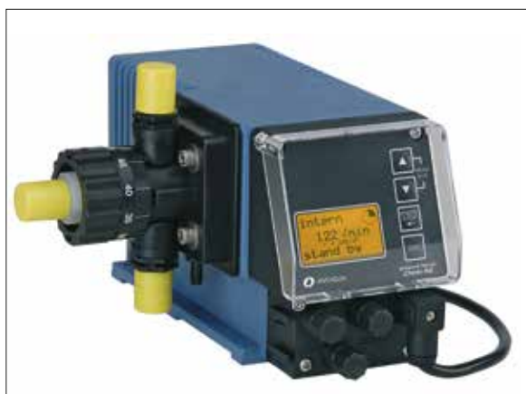
Chem-Ad Series A