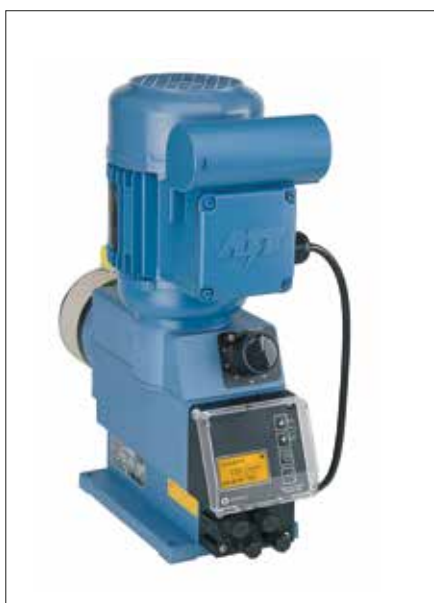
Chem-Ad Series C