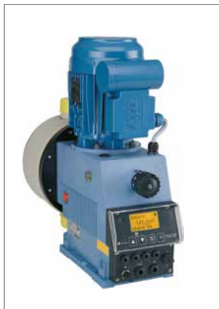
Chem-Ad Series D