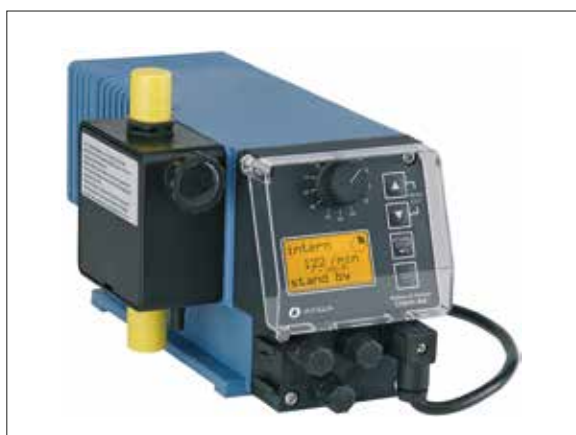
Chem-Ad Series B