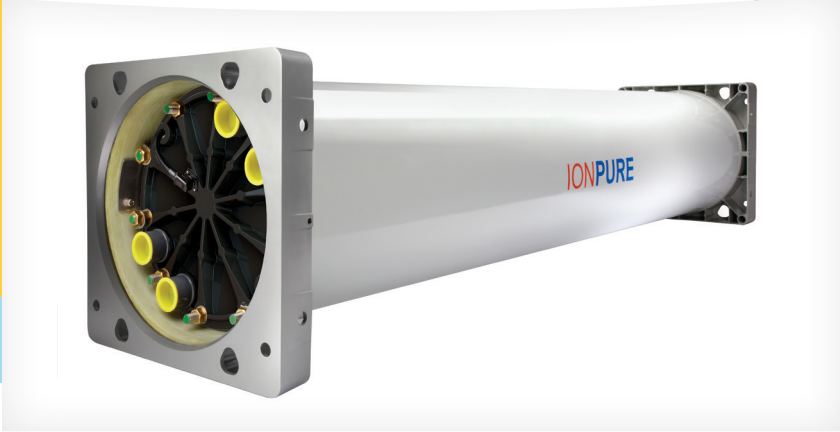
Ionpure® VNX Enhanced Performance High Flow Continuous Electrodeionization (CEDI) Modules