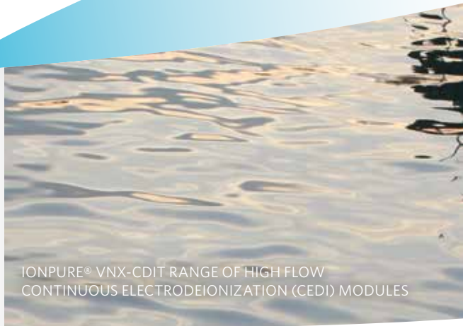
IONPURE® VNX-CDIT RANGE OF HIGH FLOW CONTINUOUS ELECTRODEIONIZATION (CEDI) MODULES