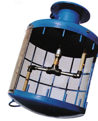
Self-cleaning suction strainer. Removes coarse debris from water entering the system

The ProStrainer pump strainer is an excellent solution for precleaning applications requiring filtration of particles up to 3 mm. up to 3 mm. It is particularly well suited for filtration applications where pump protection is required, such as in rivers and lakes. The filter components are made of stainless steel.