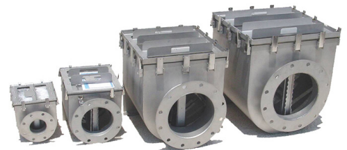
ProStrainer System Pump strainer, flow straightener and air vent in one housing