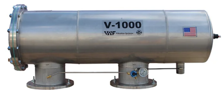
V series automatic screen filters. State-of-the-art self-cleaning strainer technology