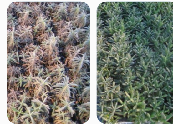
Images: Comparison of lavender plants without Peroxide UltraPure™ (left), and with Peroxide UltraPure™ (right). Plants that received Peroxide UltraPure™ show a much lower incidence of phythium..

Peroxide UltraPure™ eliminates these pathogens while boosting plant resistance, ensuring healthier crops and clean irrigation—without chemical byproducts.